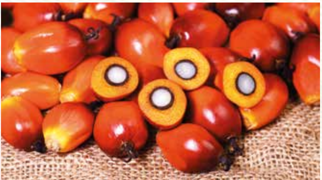
Cross section of the palm oil fruit with the palm kernel.

In this context, working conditions and the observance of land use rights are taken into account, areas worthy of protection such as rainforest areas and peat bogs are protected from uncontrolled expansion of oil palm plantations, and the rights of indigenous peoples are respected [4] . Currently 20% of all traded palm oil is RSPO certified [5] .