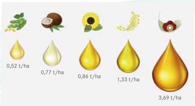
Yield from the most common plants for vegetable oil production.

The oil palm is by far the highest-yielding oil crop and yields up to 3.69 tons of oil per hectare (rapeseed yields 1.33 t/ha, sunflower 0.96 t/ha, coconut 0.77 t/ha and soya plants 0.52 t/ha) [1] .